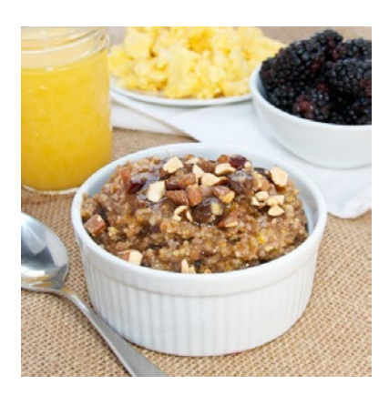
Bulgur Hot Cereal