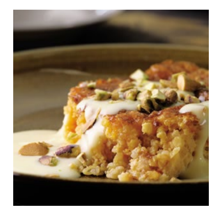
Apricot-Bulgur Pudding Cake