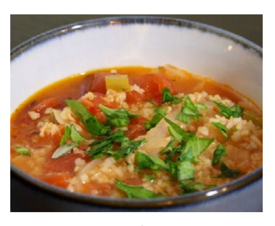
Tomato Bulgur Soup