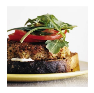
Bulgur Veggie Burger