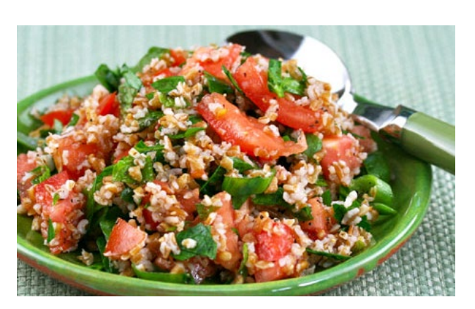
Bulgur Tabouli Salad