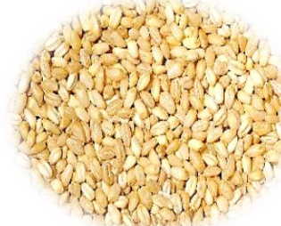
Pearled Wheat (ND)