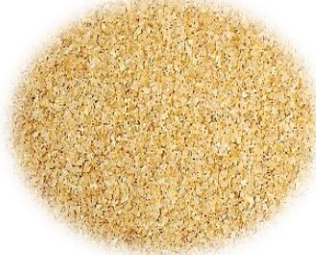
#1 Fine Bulgur