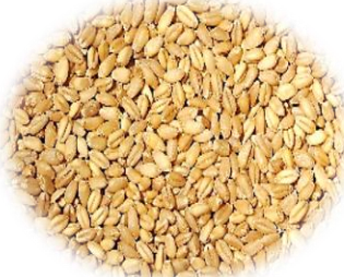
Whole Wheat Berries