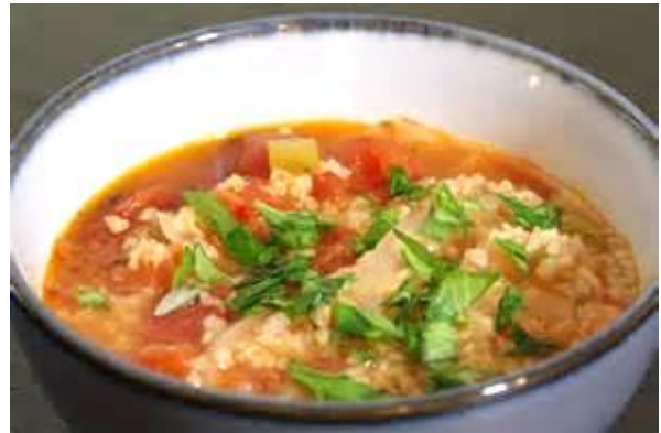
Tomato Bulgur Soup