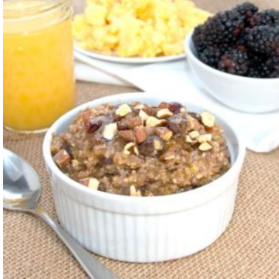
Bulgur Hot Cereal