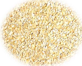
Yarma (Pearled Ground Wheat)