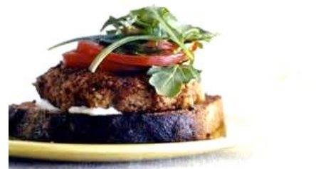
Bulgur Veggie Burger