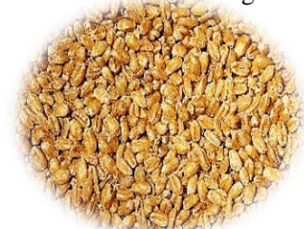
Whole Kernel Bulgur