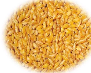
#1 Fine Dark Brown Bulgur #3 Coarse Dark Brown Bulgur Whole Kernel Red Wheat Berries