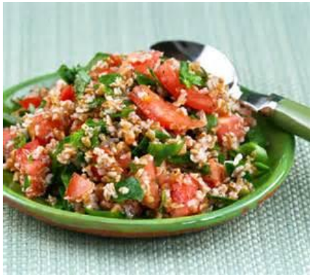
Bulgur Tabouli Salad