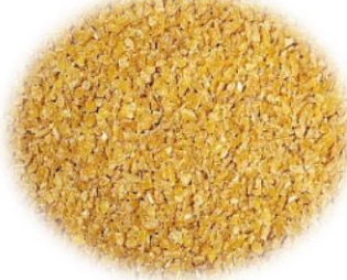
#3 Coarse Kamut® Khorasan Bulgur