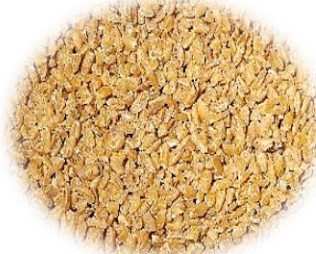
#5 Half Cut Bulgur