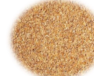
#1 Fine Farro Bulgur