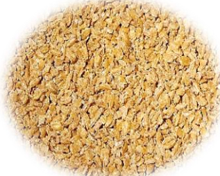
#4 Extra Coarse Bulgur