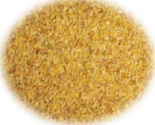
#1 Fine Freekeh Bulgur