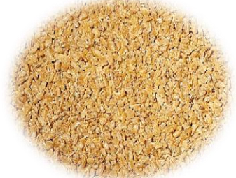
#3 Coarse Bulgur