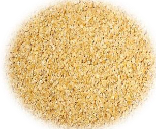
#2 Medium Bulgur