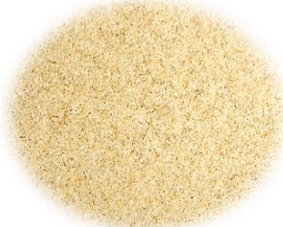
#0 Extra Fine Bulgur