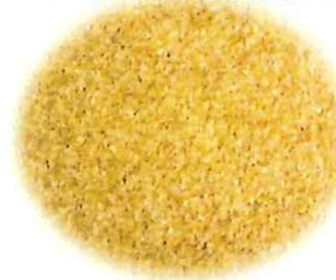
#1 Fine Kamut® Khorasan Bulgur