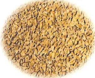
#4 Extra Coarse Bulgur