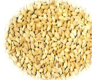
Pearled Wheat (ND)