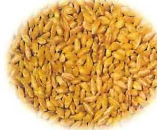
Grano – Pearled Durum