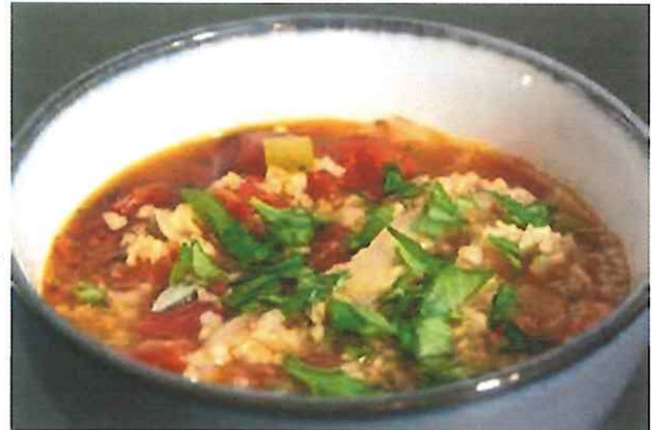
Tomato Bulgur Soup