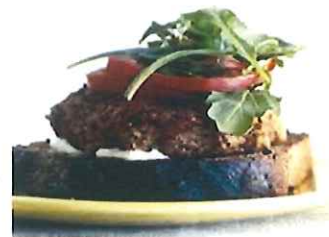
Bulgur Veggie Burger