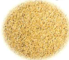
#2 Medium Bulgur