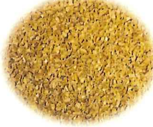
#3 Coarse Kamut® Khorasan Bulgur