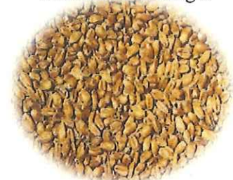
Whole Kernel Bulgur