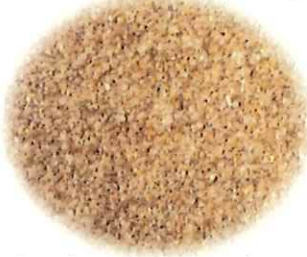
#1 Fine Dark Brown Bulgur