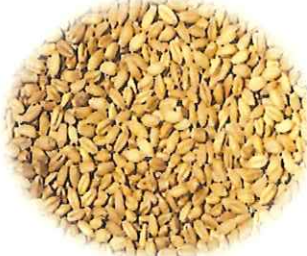
Whole Wheat Berries