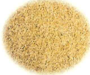
#1 Fine Bulgur