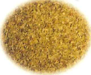
#1 Fine Freekeh Bulgur