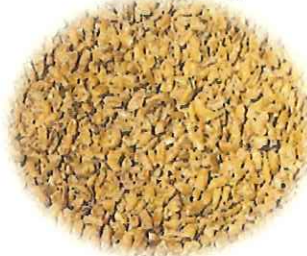
#5 Half Cut Bulgur