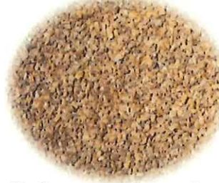
#3 Coarse Dark Brown Bulgur