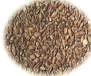
Whole Kernel Red Wheat Berries