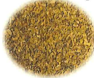
#3 Coarse Freekeh Bulgur