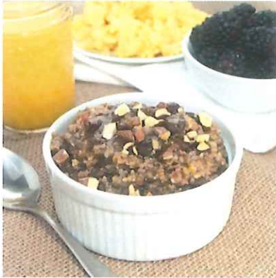
Bulgur Hot Cereal