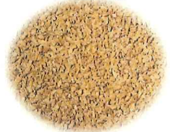
#3 Coarse Bulgur