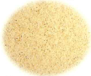
#0 Extra Fine Bulgur