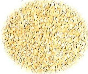
Yarma (Pearled Ground Wheat)