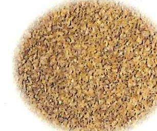
#1 Fine Farro Bulgur